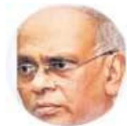
BY W.A. WIJewardena

( http://www.ft.lk/article/636464/Sri-Lanka's-march-toward-emerging-sciences:-A-rugged-road-but-not-impossible-to-tread )