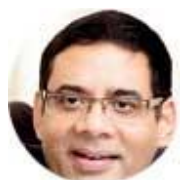
BY DINESH WEERAKKODY

( http://www.ft.lk/article/636015/When-political-power-is-wielded-by-a-small-elite )