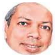
BY AJANTHA DHARMASIRI

( http://www.ft.lk/article/636456/Comprehending-'Consumer-Strategy':-Memoirs-of-a-memorable-eve )