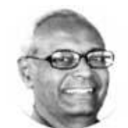
BY P.K. BALACHANDRAN

( http://www.ft.lk/article/636189/India's-'Act-East'-policy-rests-on-forging-closer-links-with-ASEAN )