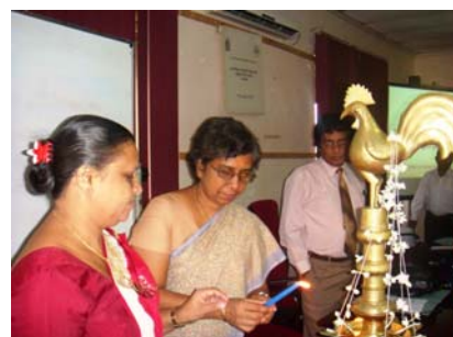
The DCS conducted regional level workshops to get feed back from the DCS field staff on Census of Population 2011.